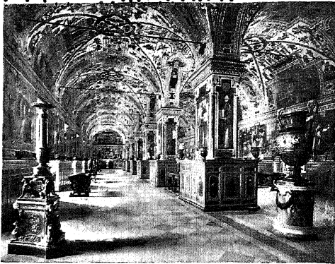
THE LIBRARY OF THE VATICAN, ROME.